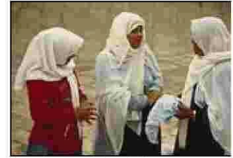
Moslem girls at Damascus Gate market, Israel

The factors that hold a Muslim to his religion are usually only about 10 percent theological and 90 percent cultural. Muslims have to fit into a larger group of people in order to feel secure and "belong." This could be an extended family, a network of friends, etc. In this "community" (the Muslim term for this is, "umma") there is tremendous security and safety. If they ever lose their job, no problem! Their "community" will help them out until a new job is found.