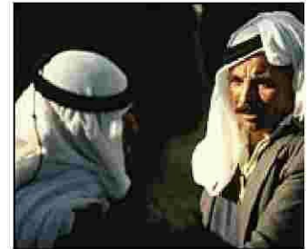
Palestinian shoppers, Moslem Quarter, Old Jerusalem

When Muslims are confronted with the claims of Christ, they may know it to be truth, but they are more worried about leaving their "community" than they are about not having the truth. Muslims need to first find a "community" of Christians that they can belong to before they will leave their "community" of Muslims. And in most Muslim areas, there are no acceptable Christian "communities," which makes it very difficult for Muslims to follow Christ.